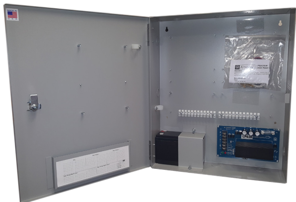
RS2 offers a complete line of products that can meet the needs of any system by delivering a wide variety of power and enclosure options.

RS2 also carries enclosure and power options from ASSA ABLOY, Altronix, Bruder Manufacturing, and LifeSafety Power.